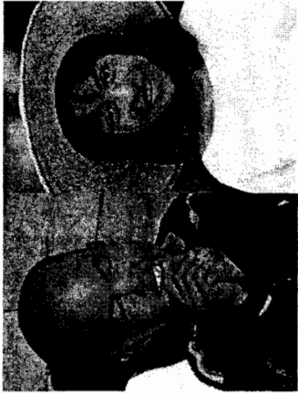
Educating Texas ...one child at a time!

For more information call the special education director at your school district: